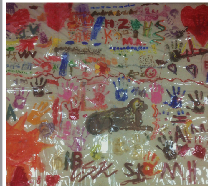
Group art work by newcomer families

https://www.porticonetwork.ca/web/rmhp/webinars/past-webinars/successful-or-promising-practices