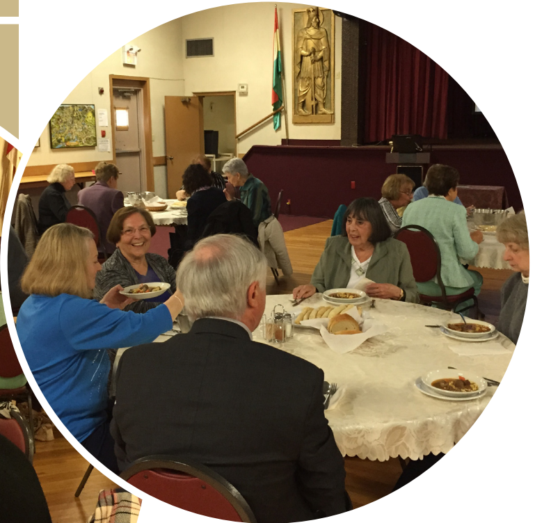
Lunch followed by a presentation at the Hungarian Club in Windsor