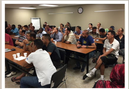
Pre-Employment events - pg. 5