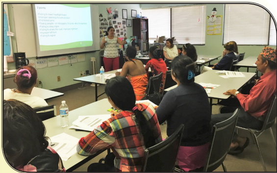
East End session