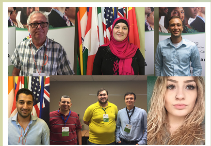
Summer Students and Volunteers - pg. 11