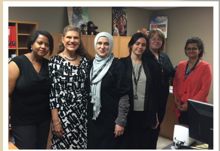
Minister Albanese visit - pg. 5